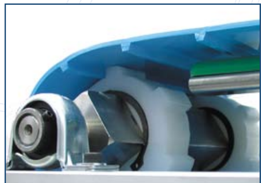
DualDrive™ and Volta supplied pulleys