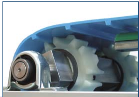
DualDrive™ and Intralox Series 800 pulleys

For maximum performance we recommend using Volta supplied pulleys. Our pulleys can be mounted on square shafts and locked in place using standard methods.