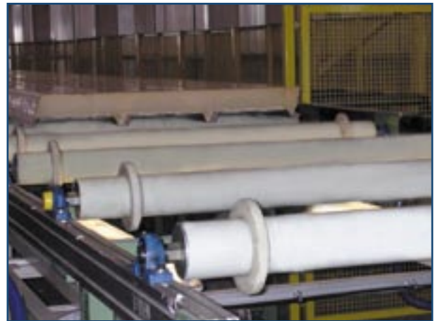
Non-marking surface protects products