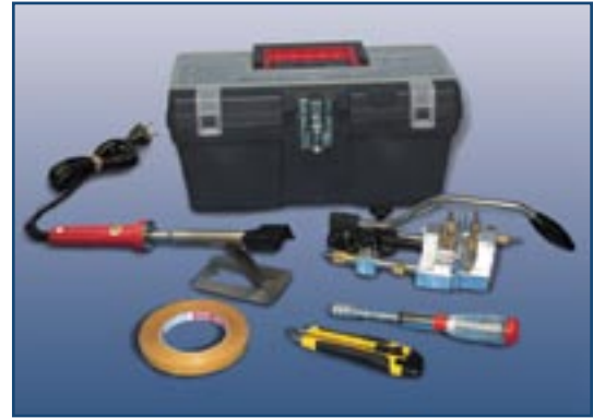
Easy Overlap Welding Kit

The tools come in a rugged plastic case with pre-cut foam to hold them in place. The kit contains all your VaR welding tools together and protects them from damage.