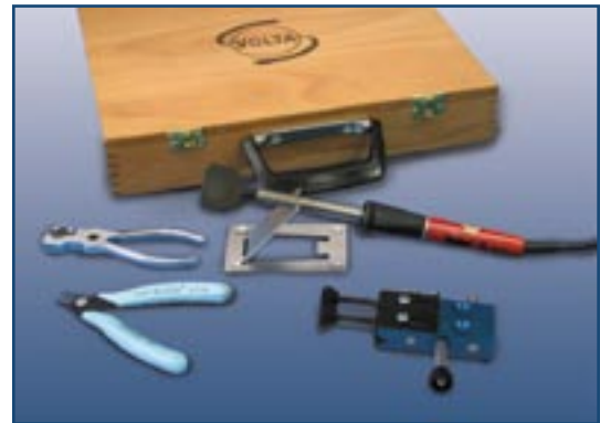
Mini VaR Tool Kit