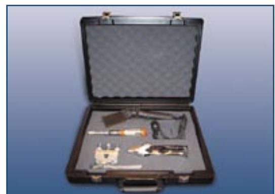
VaR Belt Welding Kit (W1000)